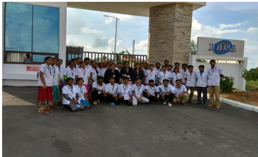
STUDENT VISIT JODAS PHARMA